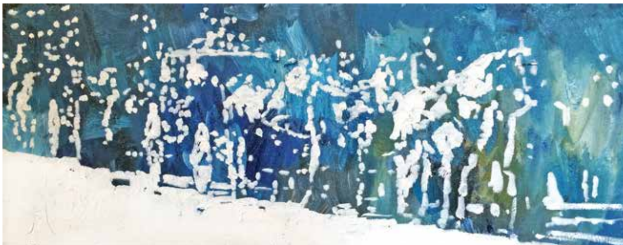
State Carriages, Oil, 30 x 45cm inc frame