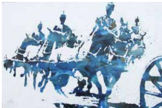
Kings Troop in Action, Oil, 70 x 100cm inc frame