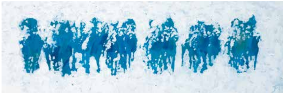
Down to a Nose, Oil, 35 x 75cm inc frame