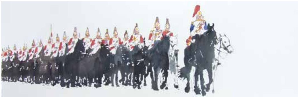
Toe to Toe, Watercolour, 35 x 60cm inc frame