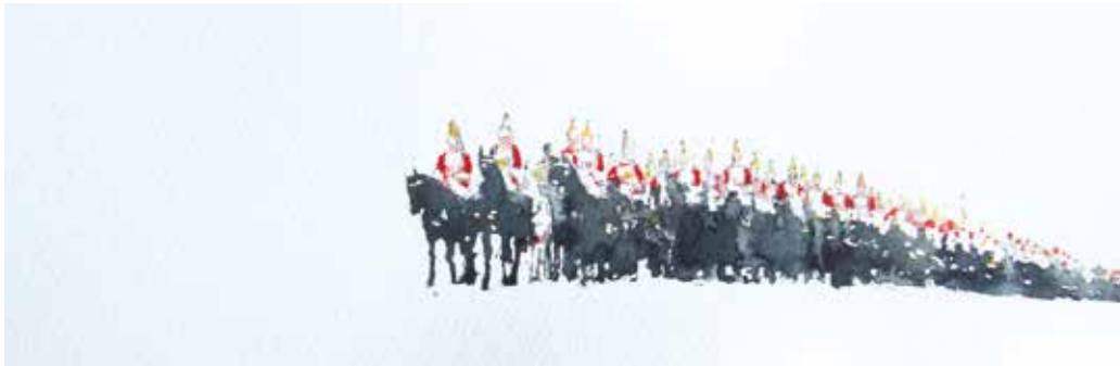
The Blues and Royals, Watercolour, 35 x 60cm inc frame