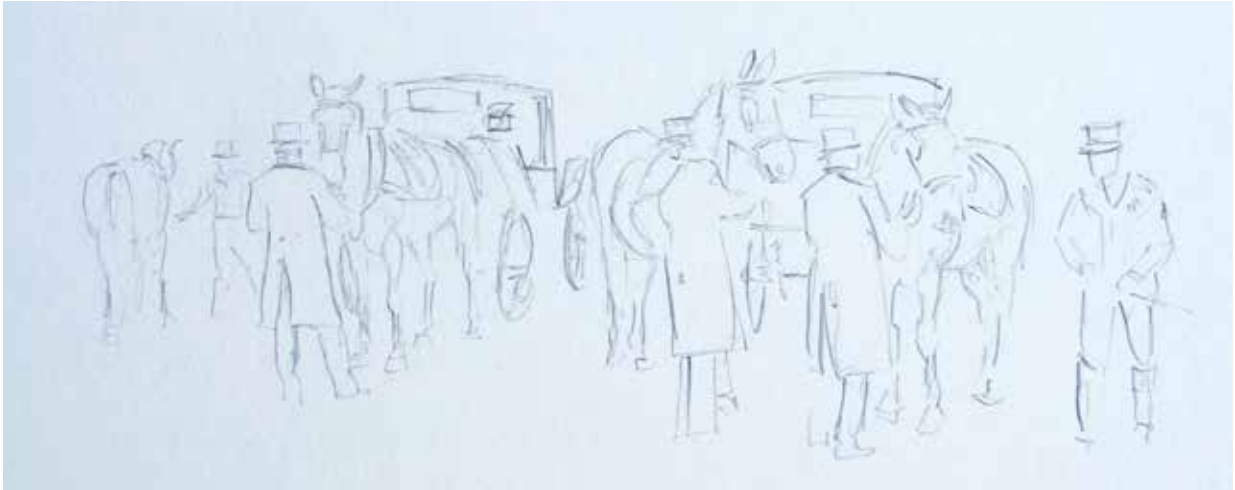
Harnessing the Horse Power, Pencil Sketch, 30 x 45cm inc frame