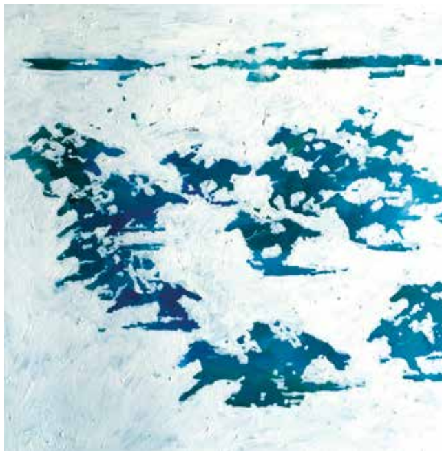
Racing at Ascot, Oil, 80 x 80cm inc frame