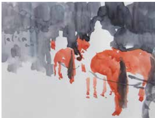
In the Beauty Parlour, Watercolour Sketch, 35 x 40 cm inc frame Bare Skins, Watercolour Sketch, 50 x 60 cm inc frame Eton College Chapel from Windsor, Watercolour Sketch, 50 x 60 cm inc frame Waiting for the Crown Equerry Inspection, Watercolour Sketch, 35 x 40 cm inc frame