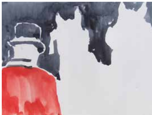
Under Inspection, Watercolour Sketch, 35 x 40 cm inc frame Job Done, Watercolour Sketch, 35 x 40 cm inc frame Lead Horses, Watercolour Sketch, 35 x 40 cm inc frame The Duke's Team, Watercolour Sketch, 35 x 40 cm inc frame