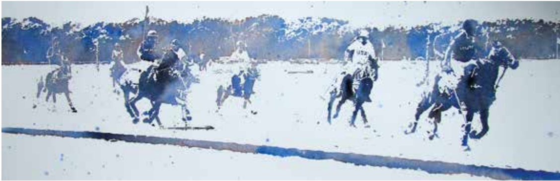
Attack; The Best Form of Defence, Watercolour, 66 x 74cm inc frame The Household Cavalry, Watercolour, 57 x 69cm inc frame The Kings Troop, Watercolour, 66 x 74cm inc frame The Kings Troop in Windsor Park, Watercolour, 57 x 69cm inc frame Polo at Guards, Watercolour, 50 x 90cm inc frame Full Tilt, Watercolour, 57 x 69cm inc frame